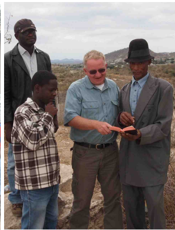
A chance for a Bible study - Mererani