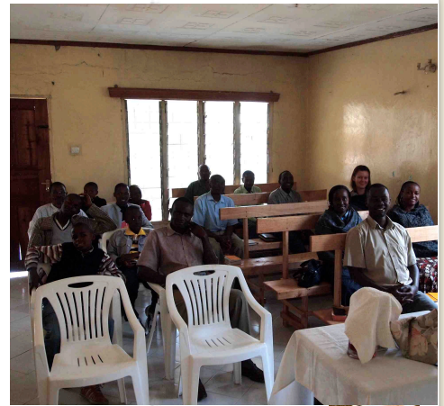
The new church building - Arusha