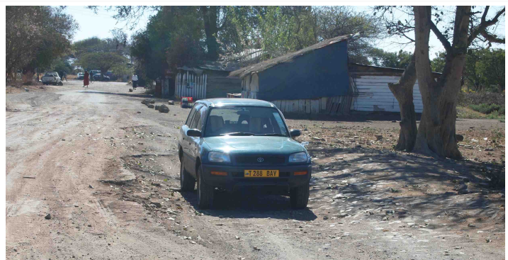
The road to Mererani