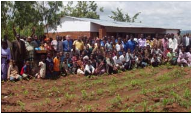
The new Somba church building

Once inside the service started and went as most Malawian services go. The services here are conducted in the same manner no matter where you go. The usual order is three songs, a prayer, the preaching, invitation song, Lord's supper, collection, closing song and prayer. After the services are dismissed, the village chief or party chairman speaks a few words of welcome. Then I make a short introduction of myself. Next, all of the preachers stand up and introduce themselves, followed by the announcing of all the